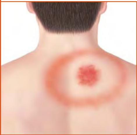
Bull's eye rash on the back.